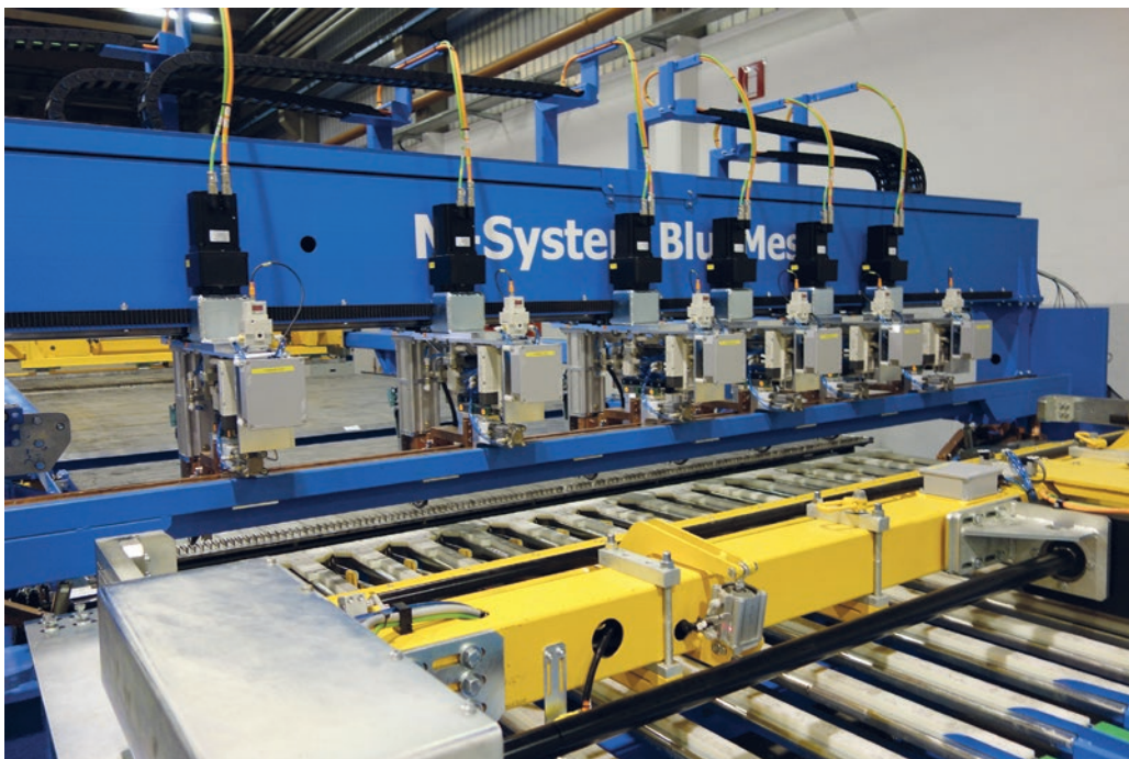
The M-System Blue-Mesh® mesh welding plant produces bespoke mesh from coil according to individual specifications.