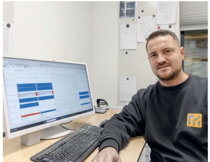
The ERPbos software enables a more efficient and consistent planning and controlling of business processes at DS Elcobyg.

DS Elcobyg is a complete supplier of concrete solutions, designing, manufacturing, and delivering for all types of construction in Denmark. With over 180 employees, the company operates from its headquarters in Hobro and has further production facilities in Genner, Southern Jutland. As part of DS Gruppen, owned by the German construction group Goldbeck, DS Elcobyg provides a wide range of construction elements, including facade panels, load-bearing structures, and customized concrete solutions. The company emphasizes lean production and sustainability, aligning with increasing industry demands for environmentally responsible construction practices.